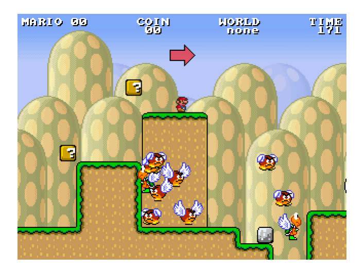
Figure 3: Enemies created in response to coins collected.

play for most subjects. In fact, unless told so, most players did not realize that the second level was created based on their own actions in the previous level. Some players remarked that the first level was boring, and subsequent levels were strange and often unpredictable, with easy segments mixed up with very hard segments.